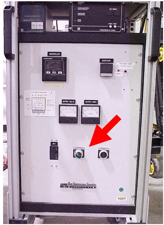
Furnace Control Panel detail