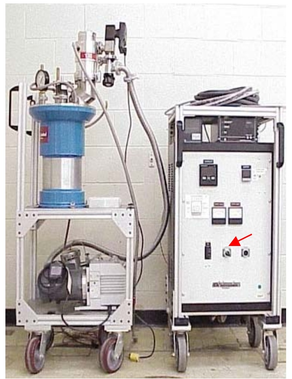
General Use Furnace