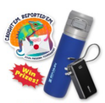
Win stickers, water bottles or more!

Be vigilant, adapt your habits, and protect your data. Just like a chameleon hiding in plain view, your information could be exposed when you least