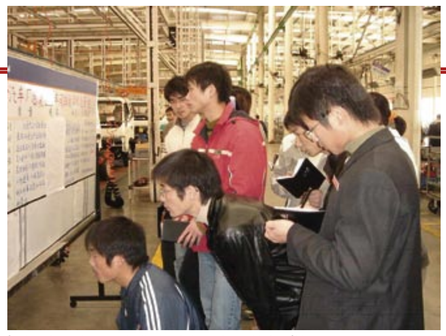
Students learn about standardization during an internship in a Chinese company.

Many of our graduates are now pursuing careers where they work in the adoption of International Standards by business. More than 1200 professionals have been trained on the adoption of International Standards for standardization organizations and companies. We have held three international forums and three national conferences on standardization. More than 50 foreign experts and 400 Chinese professionals have visited our university to discuss standardization issues (photo at right).