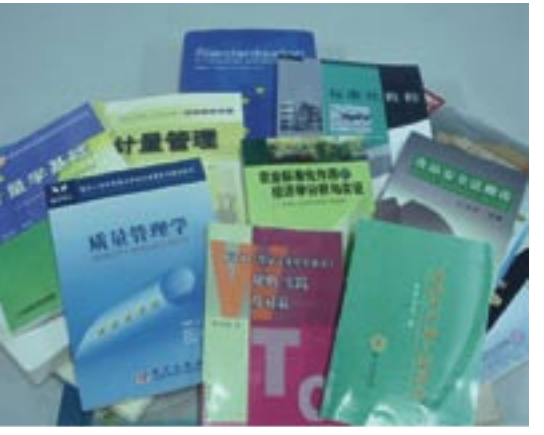
Published books on standardization.

We are planning to organize a national seminar that will serve as a platform for mutual communication among universities involved in standardization education. The seminar to be held annually will promote the rapid development of standardization education and international standardization in China.