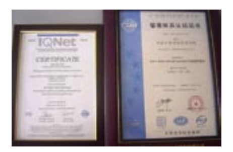
The teaching quality management system is ISO 9001:2000 certified.

gramme, a teaching quality management system based on ISO 9001:2000 has been set up. The system operates with high efficiency and is certified to ISO 9001:2000 (photo below).