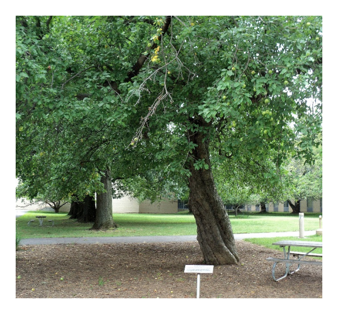
Descendant of Newton's apple tree on Gaithersburg campus