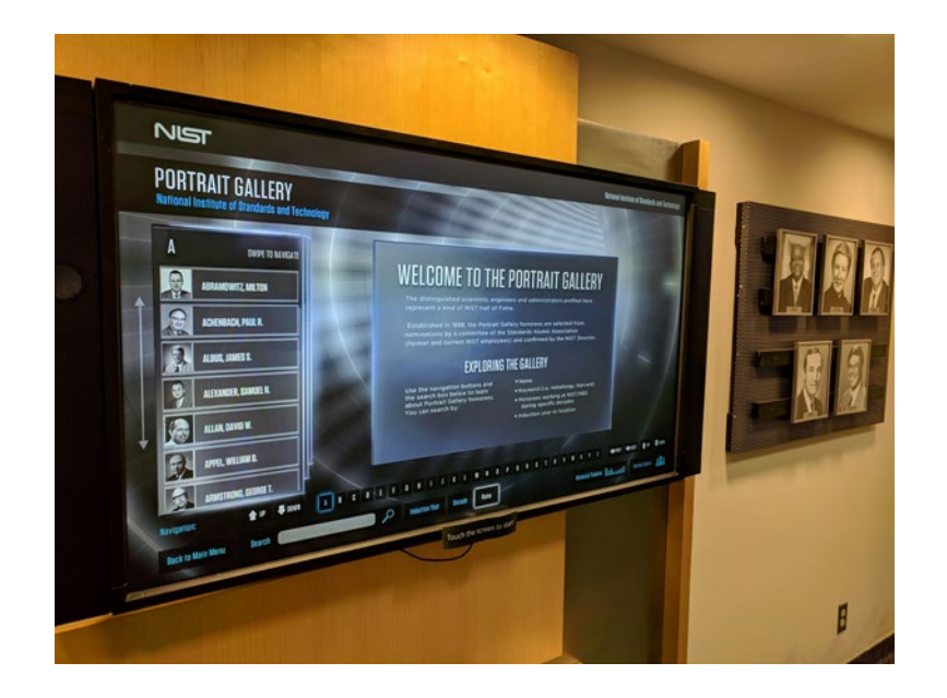
Digital Portrait Gallery