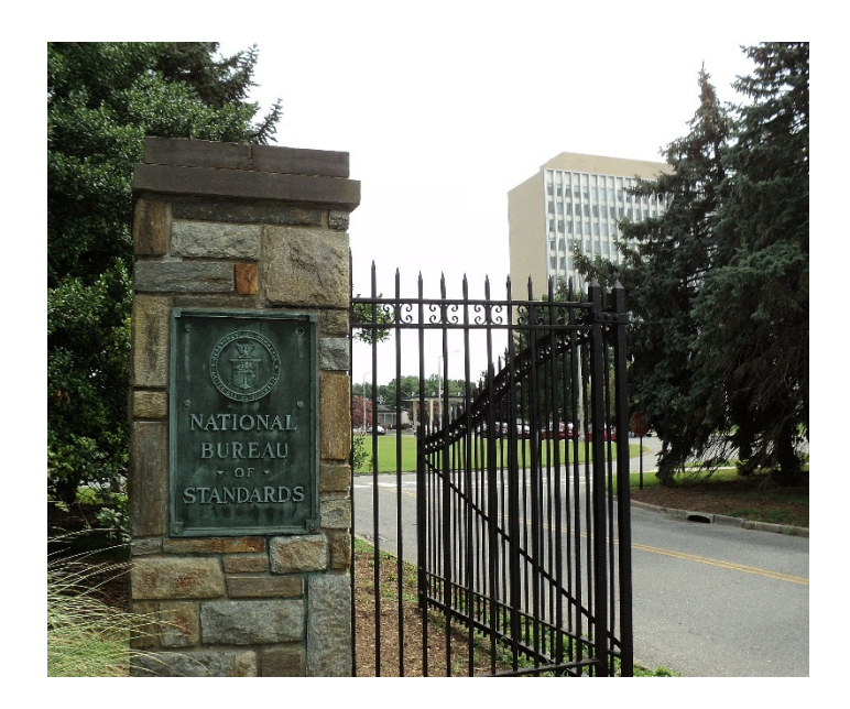
National Bureau of Standards gate from Connecticut and Van Ness site